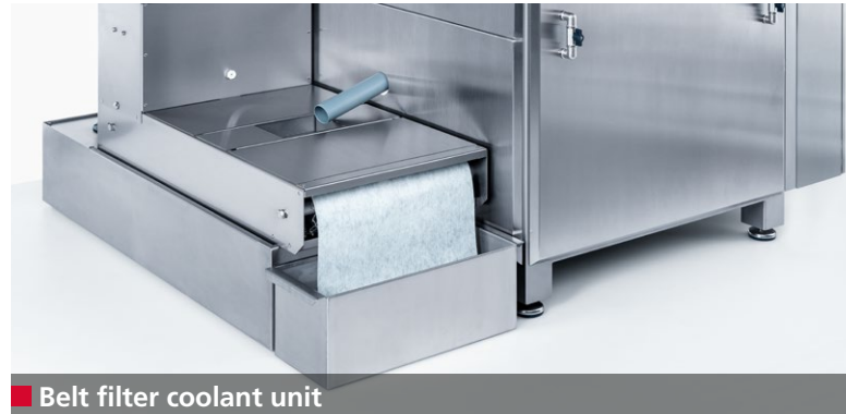
■ Belt filter coolant unit

The W40 is completely sealed. The power unit cannot be activated while the door is open. The integrated suction unit removes floating particles from the workroom. This enables visibility during the grinding process. Moreover, it protects the operator's respiratory system.