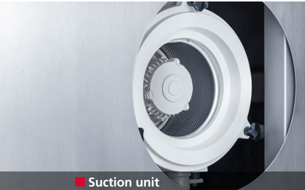
■ Suction unit

Encapsulated workroom and continuous cooling of the workpieces