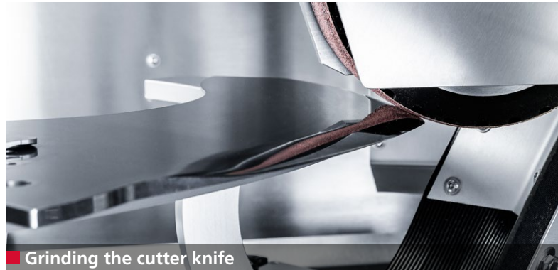
■ Grinding the cutter knife

The sharpness, blade angle, shape and profile of a cutter knife have a large influence on the quality of the products fabricated. High cutting speeds (up to 180 m per second, which equals 650 km per hour or 404 mph) and side pressure put a substantial amount of mechanical strain on the cutter knives. Thus, the polished edge of a cutter knife has a direct impact on its break resistance.