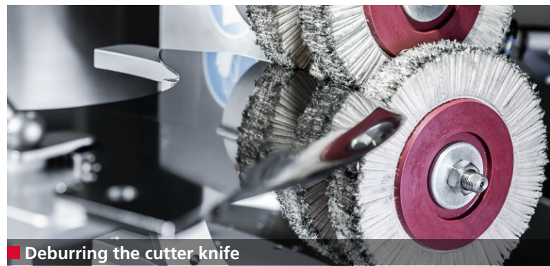
■ Deburring the cutter knife

The B 500 sharpens, polishes and deburrs up to 100 cutter knives (500 l) per 8-hour shift, fully automatically. The average sharpening and polishing time per knife runs from 3–5 minutes, depending on the blade size.