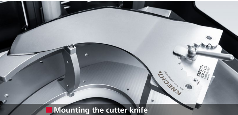
■ Mounting the cutter knife

Fully automated grinding of cutter knives